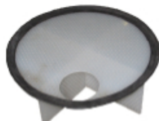
Salt grid for brine tanks 200 L to 1500 L